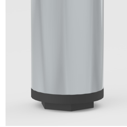
Floor protector with level compensation: compensates for uneven floors