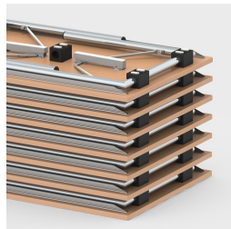
Stackable up to 16 tables