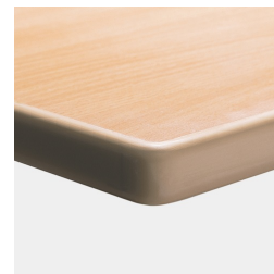
Optional melamine coated table top with ASSODUR® edge