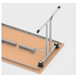
Easy folding of the table legs