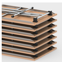
Stackable up to 16 tables