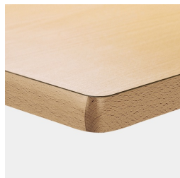
Optional melamine coated table top with solid wood edge