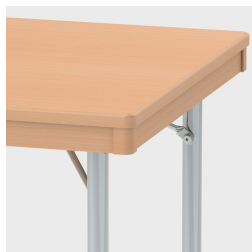
Optionally with recessed solid wood frame