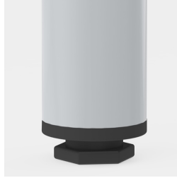
Floor saver with level compensation compensates for uneven floors