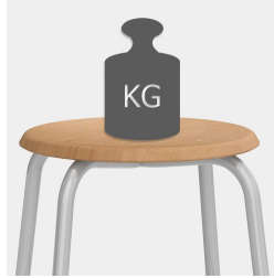
Robust 4-legged frame