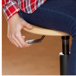
Height adjustment by safety gas spring