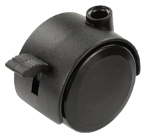
Mobile on 4 lockable double castors