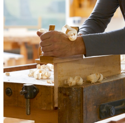
Solid beech wood from sustainable forestry with water-based varnish