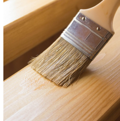
Painted with environmentally friendly water-based paint.