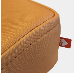
High quality crosscut seam