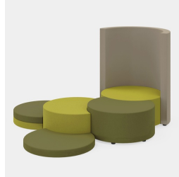
Wide range of possible combinations of COCOON and JOYN series