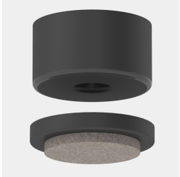
Optional felt floor protector with interchangeable insert