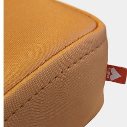
High quality crosscut seam