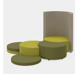
Wide range of possible combinations of COCOON and JOYN series