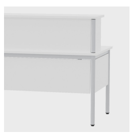
Elegant look: continuous table leg

High and deep enough for standard binders