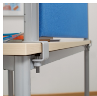
Mounting by means of Allen screw on the table top