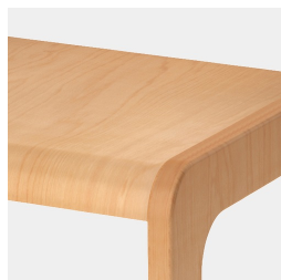
Rounded seat for comfortable sitting