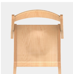
Body shaped seat and back