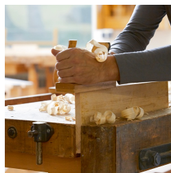
Solid beech wood from sustainable forestry with water-based varnish