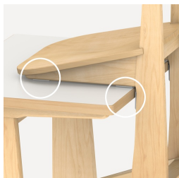
Protective pads protect table top during upstroking