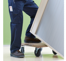
Carcass firmly doweled and glued ex works