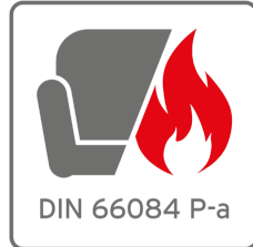
Optionally fire protection certified according to DIN 66084 P-a with cover fabric B1