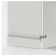
With drag base on the door