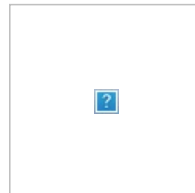
Stauraum für bis zu zwei Materialwägen