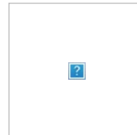
Stauraum für bis zu drei Materialwägen