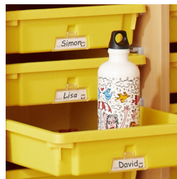
robust Tidy Boxes