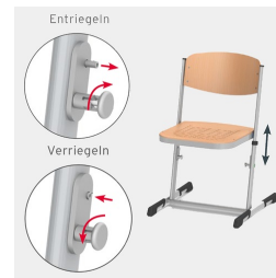
Multiple height adjustable through simple safety adjustment