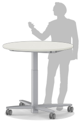
Can also be used as a mobile lectern