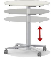
Infinitely height-adjustable in the range of 71-111 cm