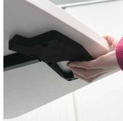
Safety hand release prevents unintentional triggering of height adjustment