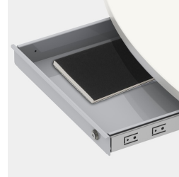
Optionally with lockable steel valuables drawer