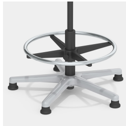
Robust aluminum base with elevation and chrome-plated foot ring, height adjustable