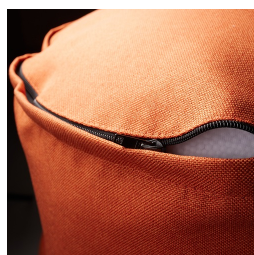
Cover removable by zipper