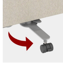
Rotatable base optionally with casters