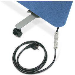
Optionally with electrical set