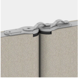
Patented connecting element for linking without tools