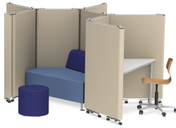
Flexible zoning of the room