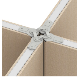
Up to four walls can be linked in one point