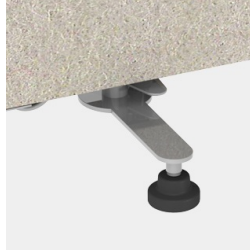
Rotatable base with plastic feet