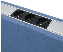
Optional electrical set with 3-way grounded socket outlet