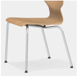
Robust 4-leg frame