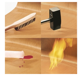
Seat and back melamine coated: scratch, break and impact resistant; flame retardant