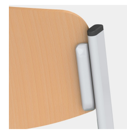
Seat and back concealed screwed