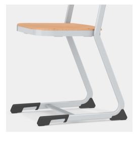
Stable and solid C-shape frame