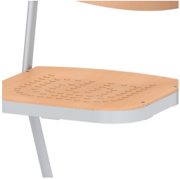
Seat surface with pressed-in, anti-slip knobs