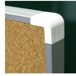
Edge protection due to rounded safety corners