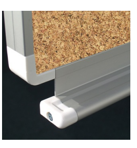
Matching shelf for chalk and pens