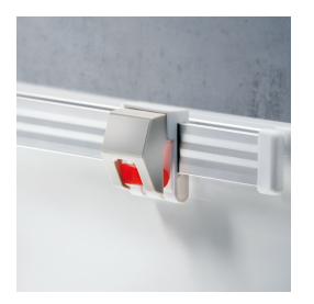
Optionally with picture clamping bar