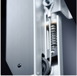
Maintenance-free, low-noise precision guidance on 8 ball-bearing track rollers