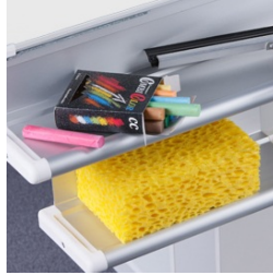
Eraser and pen tray included