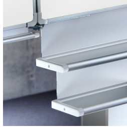
Edge protection due to rounded safety corners