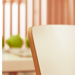
Seat shell optionally coated with scratch-resistant multiplex finish