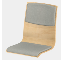
Optionally with seat and backrest upholstery