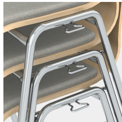
Stackable up to 9 chairs (with or without seat upholstery)