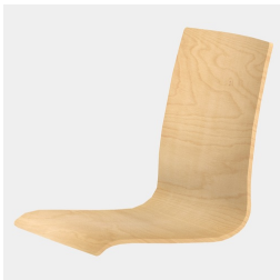
Body contoured seat shell