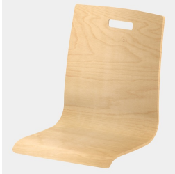
Optionally with rectangular grip hole (not with backrest upholstery)