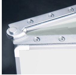
Panel wings can be folded out at 180° angle