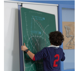
Removable board elements