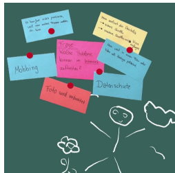
Magnetic surface can be written on with chalk