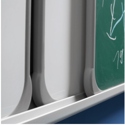
Board elements with ASSODUR® edge can be moved one behind the other