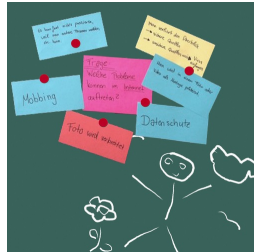
Magnetic surface can be written on with chalk