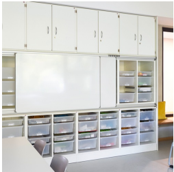
Can be mounted on cabinet wall