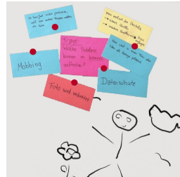
Magnetic surface can be written on with whiteboard pens