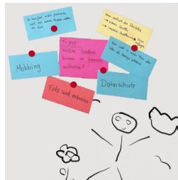
Magnetic surface can be written on with whiteboard pens