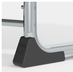
Tilt protection due to special floor protectors