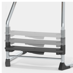
Tool-free adjustment of the footrest with only one hand