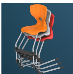
Stackable up to 3 chairs