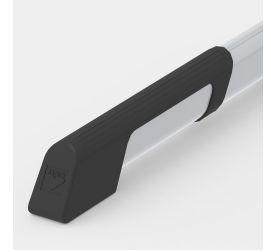
Floor protectors with integrated step protection