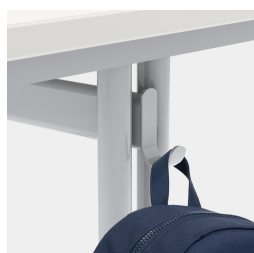
Includes one satchel hook per seat