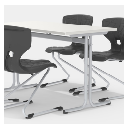
Seating on both sides due to central column frame