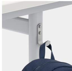
Includes one satchel hook per seat