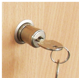
Sliding doors lockable