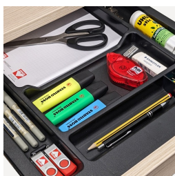
utensil drawer for office supplies