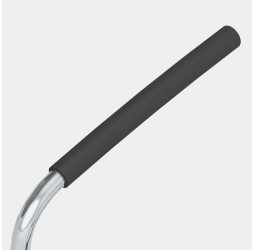
Including armrest with black softgrip cover