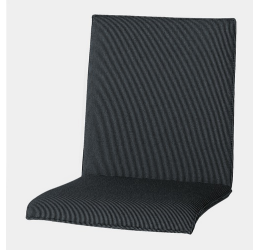
Body contoured seat shell with full upholstery