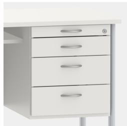
Base unit includes pencil drawer and drawers with soft-closing mechanism and central locking system