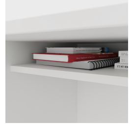
Including practical tray