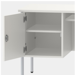
Base cabinet includes one shelf, lockable by means of security lock