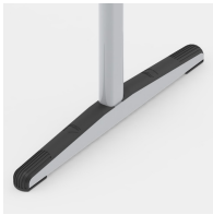
Floor protector with continuous step protection