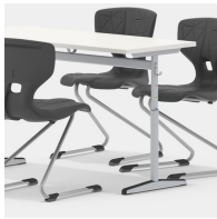
Seating on both sides due to central column frame