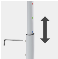
Height adjustable by means of locking device