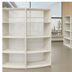
Back wall made of translucent plexiglass