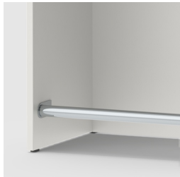
Includes footrest for comfortable resting of the feet.