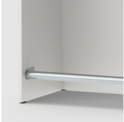
Includes footrest for comfortable resting of the feet.