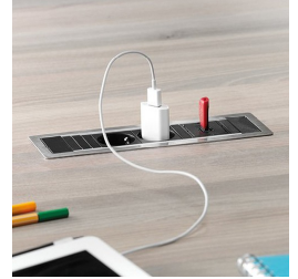
Optionally two socket outlets each with USB port or network connection: 1x center, 1x left, 1x right or both sides