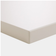
Board material melamine coated with robust plastic edge