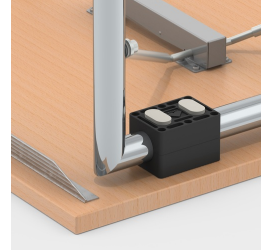
Stacking protectors protect the table top from scratch marks