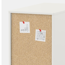
Back wall optionally covered with cork